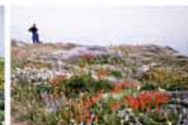
Low color light output

Actual photographs of images taken from two competing projectors run in default mode. Price, resolution and brightness (white light output) are the same for both projectors.