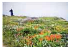
High color light output