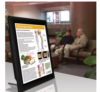
RSB-LET1 -Illuma-Display™ LED Backlit Sign