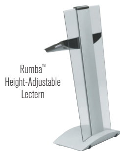
Rumba™ Height-Adjustable Lectern

Safco Products Company 9300 West Research Center Road, Minneapolis, MN 55428 phone 800-328-3020/Customer Care fax 763-971-1525 Locations in Minneapolis, MN - Headquarters Atlanta, GA, Riverside, CA and Norfolk, VA ©2012 Safco Products Company. All rights reserved. safcoproducts.com