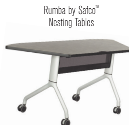
Rumba by Safco™ Nesting Tables

Make collaboration a team effort with these complementary Safco Products!