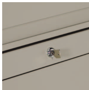
Lock located in optional posting shelf position (ADA compliant)