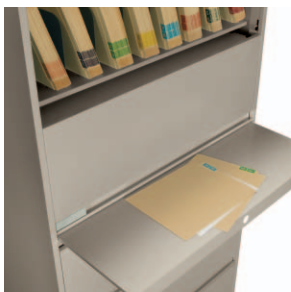
Posting shelf for sorting documents (Optional)