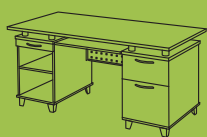
Executive Desk AQ 12-6030