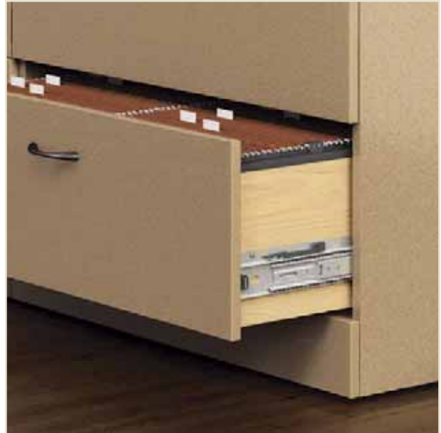
Box drawers are mounted on 3/4 extension ball bearing slides.