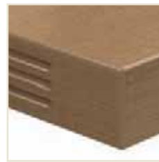
1 1/2" with fluted edge (CF)