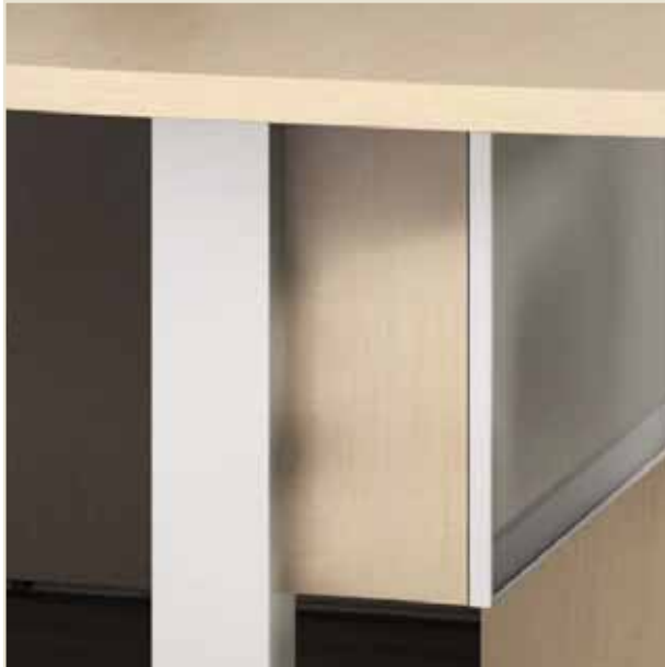
4" square monopost are available in Silver or Black finish. Optional 4" and 5" round are available at no extra charge.

Zira™ is the most functional solution to your work environment efficiency and organization.