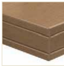
1 1/2" with bicut edge (CR)