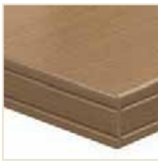
1" with bicut edge (AR)