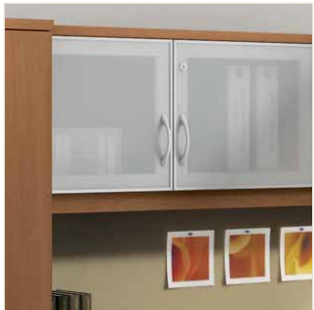
Hutch with glazed doors are available in 4 glazing options with Silver or Black frames. 9 handle options in Silver, Black, Nickel or Brass finishes.