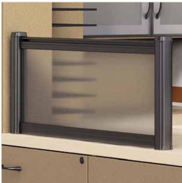
Divide™ a modular desk-mounted panel system shown with glazed panels which vertically stack to provide privacy.