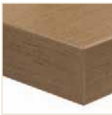
1 1/2" with 3mm edge (C3)