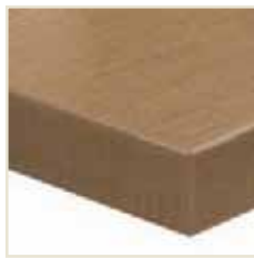
1" with 3mm edge (A3)