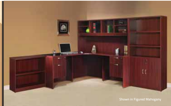
Shown in Figured Mahogany