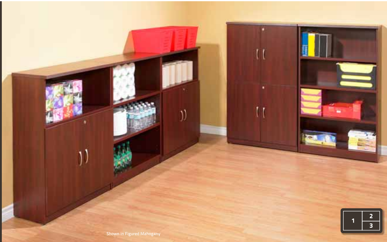
Shown in Figured Mahogany