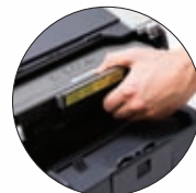
Cost effective with high-yield replacement toner cartridges