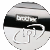
Enjoy the freedom of wireless network printing