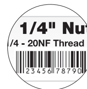
Various bar codes available.