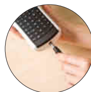
Save on batteries with optional AC adapter†