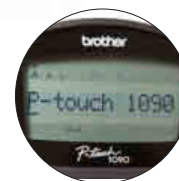
Large, easy-view display